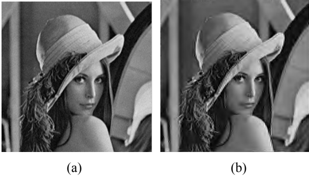
Fig. 4. (a) Compressed by DCT (b) Compressed by EZW

Results of the realized work are given in Table 1.