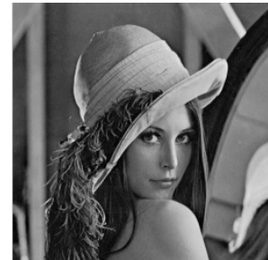
Fig. 3. Original image

We are comparing the images which are compressed by applying EZW and DCT using MATLAB.